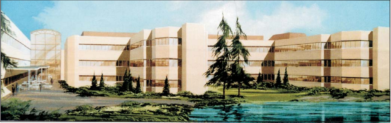
Artist Concept - Thunder Bay Regional Hospital